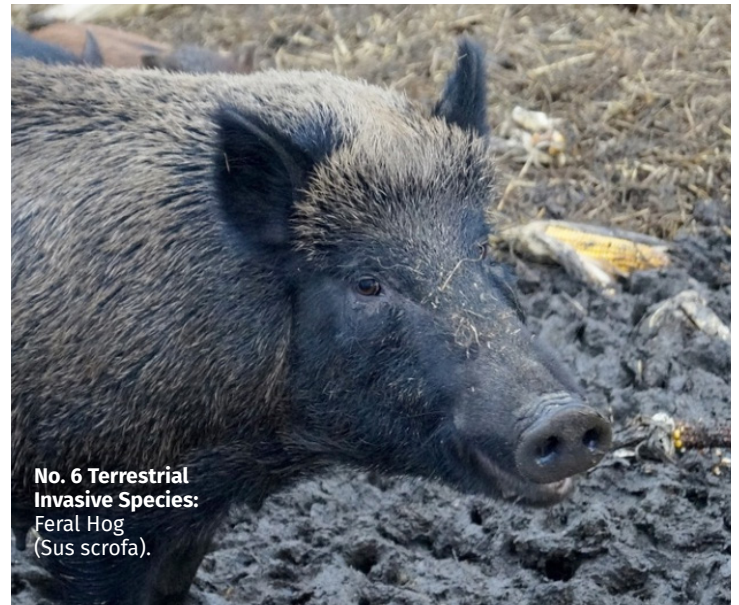
No. 6 Terrestrial Invasive Species: Feral Hog ( Sus scrofa ).