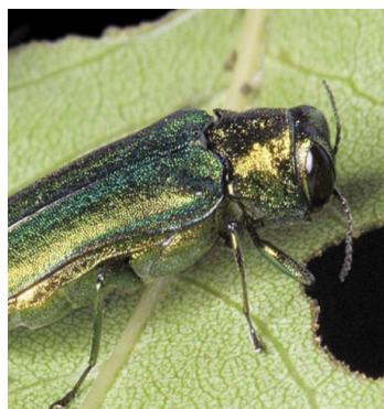
No. 5 Terrestrial Invasive Species: Emerald Ash Borer ( Agrilus planipennis )