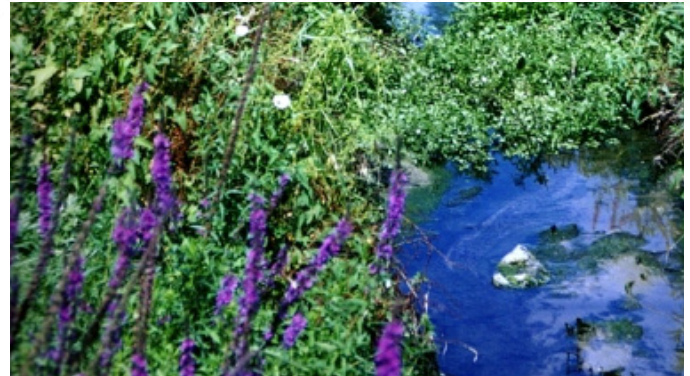
Aquatic Invasive Species, clockwise from left: No. 5 Curly-leaved pondweed ( Potamogeton crispus ); No. 8 Purple loosestrife ; Lythrum salicaria ; No. 1 Eurasian Watermilfoil ( Myriophyllum spicatum ); No. 14 Rusty crayfish ( Orconectes rusticus )