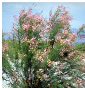
No. 1 Terrestrial Invasive Species: Salt cedar (tamarisk) ( Tamarix spp.)

The Western Governors' Association (WGA) has addressed this need by surveying invasive species coordinators in WGA member states and territories