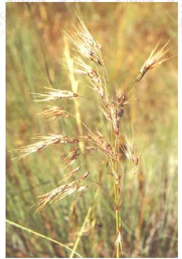
Terrestrial Invasive Species, from left: No. 9 Johnsongrass ( Sorghum halepense ); No. 3 Canada thistle ( Cirsium arvense (L.) Scop.); No. 8 Leafy spurge ( Euphorbia esula ); No. 2 Cheatgrass ( Bromus tectorum )