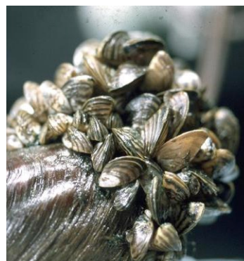
No. 2 Aquatic Invasive Species: Quagga and Zebra Mussel ( Dreissena polymorpha )

to develop the “Top 50 Invasive Species in the West.” The compilation of terrestrial and aquatic invasive species includes highly-publicized examples such as cheatgrass, Quagga Mussels, tamarisk and the Emerald Ash Borer. The list also encompasses less well known, but still impactful, examples such as leafy spurge, Red shiner, Russian knapweed, and Golden algae.