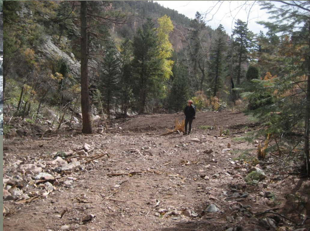
Completed Channel Work