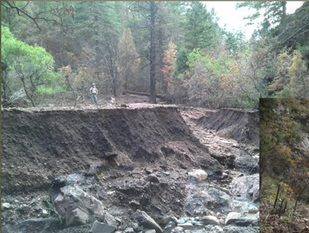
After July 1st Event