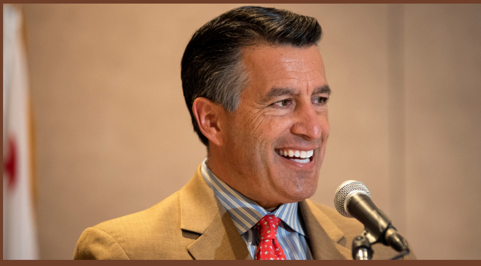
Nevada Gov. Brian Sandoval noted in his keynote that invasive species "can interrupt the very social fabric of the West."

spoke and highlighted how "Western Governors are using their convening power and energy to confront the scourge of invasive species. The impacts of invasive species in the West are as pervasive as they are underreported. "