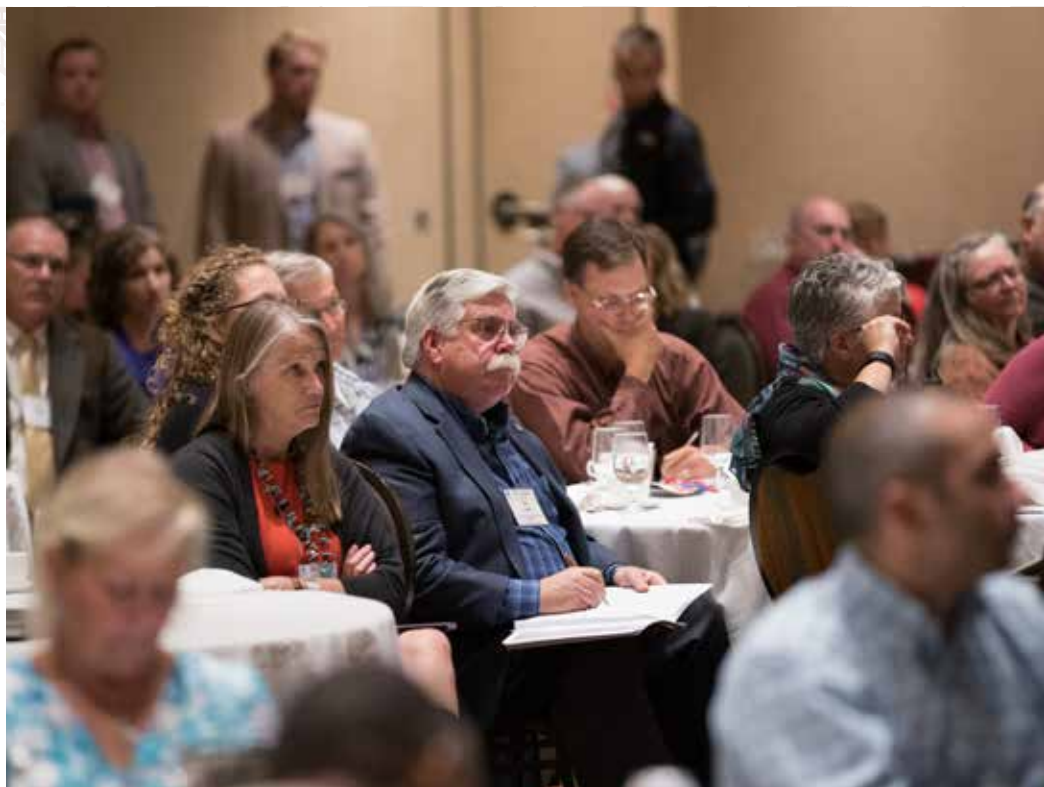
Workshops of the Chairman's Initiative gathered a wide array of stakeholders at workshops in Montana, Idaho, South Dakota and Oregon.

Whether through collaborative efforts to determine appropriate timber and grazing prescriptions, reintroduction of fire to control fuels and support wildlife habitat, projects to combat invasive species, or improvements to watershed functions, new and diverse partnerships are emerging across land ownerships to help improve the health and resiliency of western landscapes. Now more than ever, sustaining and building upon this progress in the face of unprecedented threats to our forests and rangelands requires our collective attention and action.