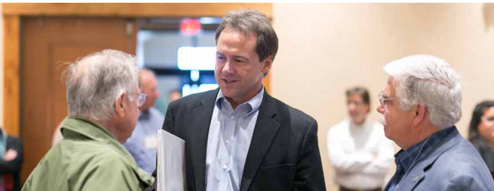
Montana Governor Steve Bullock hosted the opening workshop of the Initiative in Missoula. He urged attendees in a keynote to “take a hard look at collaboration. What makes it succeed? Why does it fail? It’s a discussion that will set the stage and tone for more hard work to follow.”

Many of these administrative recommendations are intended to be quickly actionable by federal and state land managers. It is possible that, in some cases, a proposed administrative reform may ultimately require state statutory authorization. None of these proposed reforms, however, should require new federal statutory authority. They do require the commitment and resources of state and federal managers for implementation. Western Governors encourage their state agencies and federal partners to collaborate on how to most effectively implement these recommendations.