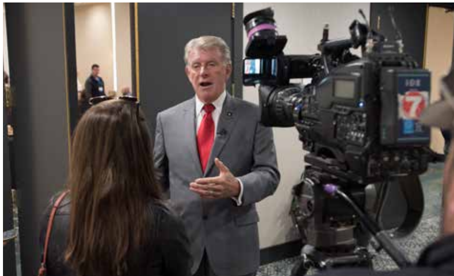
Idaho Gov. C.L. "Butch" Otter emphasized finding projects of value during his address at the Boise workshop: "I want you all to discuss all of your ideas for improving land management and let's find those with the greatest value."

The Idaho workshop also examined the success of Rangeland Fire Protection Associations (RFPAs), which engage private landowners with Bureau of Land Management wildland fire monitoring and suppression efforts. These collaborative efforts were a centerpiece of Governor Otter's message to attendees. Before 2012, ranchers were not allowed to assist federal land managers on wildfire suppression activities. The Governor, legislature, and federal and state fire agencies subsequently created the RFPAs, which have now grown to eight