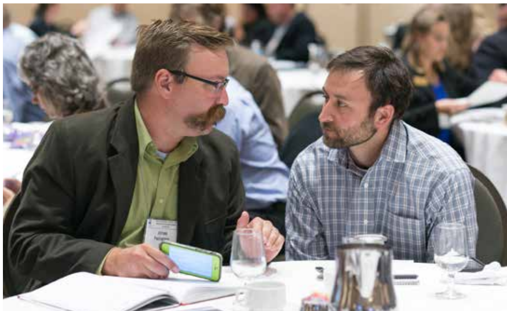
Nearly 400 attendees from across a wide spectrum took part in the regional workshops held in Montana, Idaho, South Dakota and Oregon.

L4D: Pass legislation, such as the 21st Century Conservation Service Corps Act, to make it easier for young people and veterans to complete quality, cost-effective maintenance and improvement projects on public and tribal lands and waters across the country. These programs could address the backlogged maintenance needs of land and water management agencies; enhance outdoor recreation