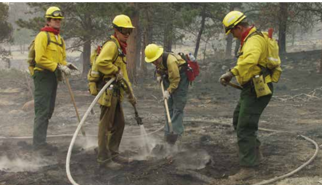
Firefighters on the 2002 Hayman Fire, whose long-term impacts dramatically affected water quality and supply for the Front Range of Colorado.

The state estimates that since 2010, more than 100 million trees have succumbed to the stress of beetle infestation or drought. Of California's 32 million acres of forestland, over 6 million acres have been classified as either Tier I or Tier II High Hazard Zones. The TMTF coordinates federal, state and local governments to ensure that restoration activities are organized effectively, ensuring that these high-hazard areas receive priority treatment. It also serves as an important focal point of communication between different layers of government, non-governmental organizations, tribes, and private landowners, providing regular updates on tree mortality and the status of restoration activities.