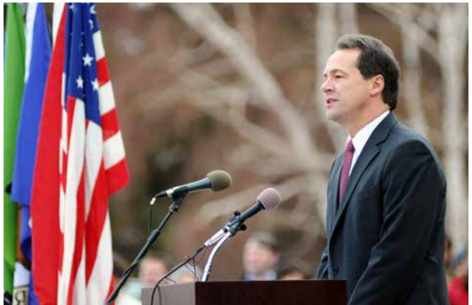
Montana Governor Steve Bullock launched the National Forest and Rangeland Management Initiative to bring states, federal land managers, private landowners and other stakeholders together to discuss issues and opportunities in forest and rangeland management.

Based upon the input from state and federal land managers, private landowners, local governments, businesses and non-governmental organizations, WGA sought to identify best practices and offer recommendations to put western