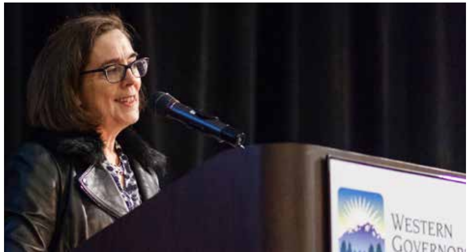
Governor Kate Brown noted during her opening remarks at the Bend workshop that "In Oregon, we continue to pursue strategies to accelerate the pace, scale, and quality of restoration of our federal forests."

Governor Brown noted, as an example, that in 2006, the timber sale program on the Malheur National Forest was effectively zero. Disagreements over forest management were grinding restoration activities to a halt. The formation of the Blue Mountain