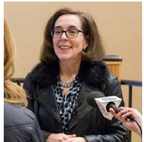
Western Governors C.L. "Butch" Otter of Idaho, left, Dennis Daugaard of South Dakota and Kate Brown of Oregon hosted Chairman's Initiative workshops in their respective states.