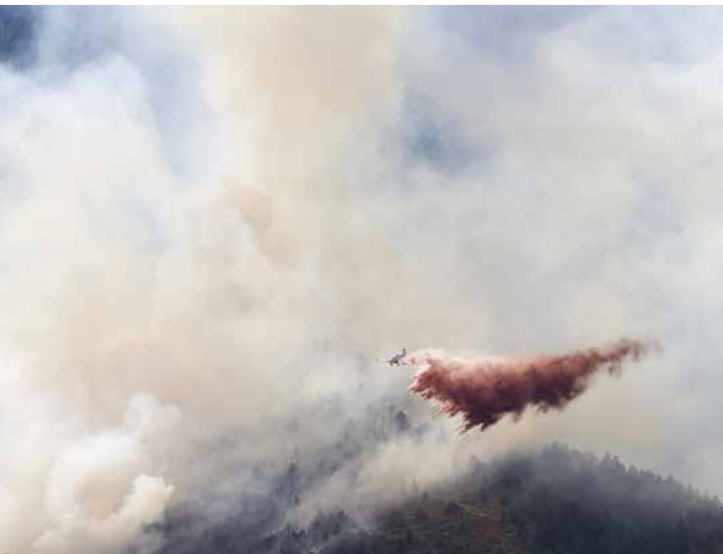
The cost of fire suppression continues to increase, as budgets remain relatively flat, which results in the need to transfer funds from non-fire to fire accounts when budgeted funds are insufficient.