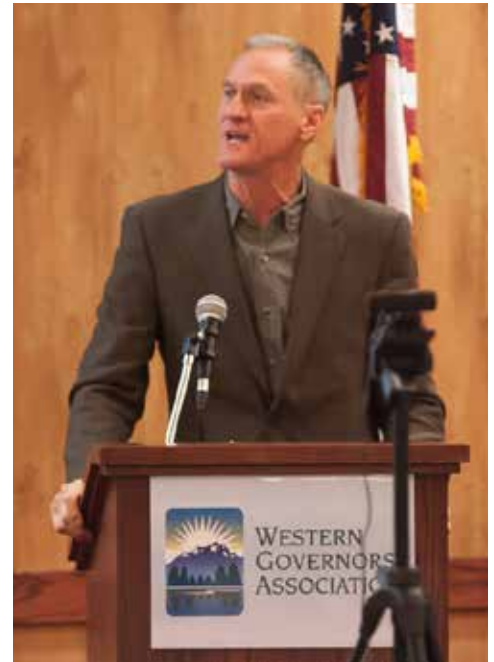
"We don't want to use this workshop to just clap each other on the back," Gov. Dennis Daugaard said at the Deadwood workshop. "We want to use this to think about how to do things better."

"Proper land management is critical," said Governor Daugaard. "It helps control fire danger and supports economic growth and tourism. The Black Hills have been a great success story for active management. Despite vibrant timbering, it is still a beautiful forest, attractive to recreationalists. And this has worked because of the great relationships developed over time between the state and USFS."