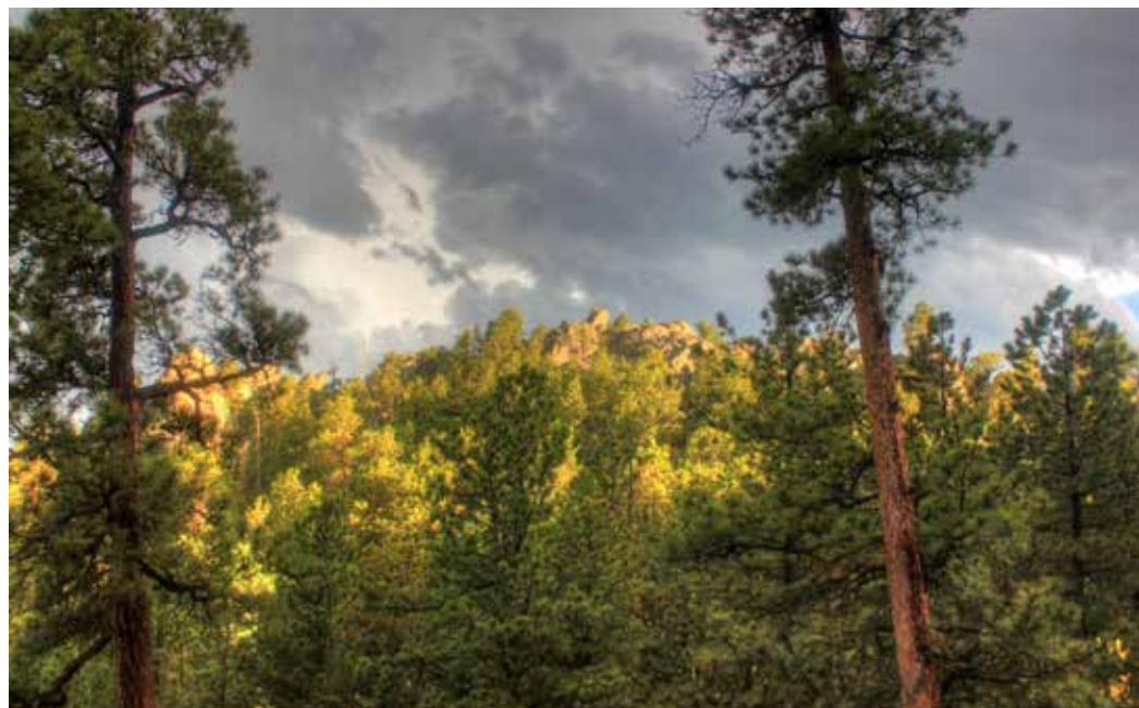
Black Hills Forest, South Dakota.