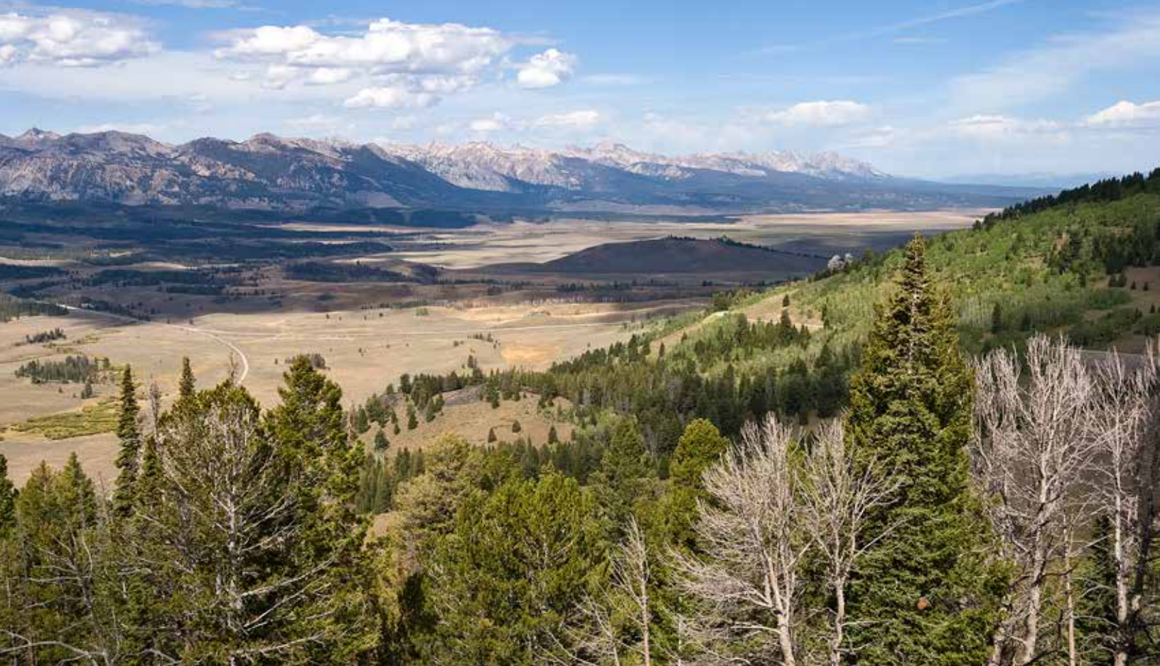
Sawtooth Valley, Idaho.

management. Montana has provided financial assistance to counties to help pay for travel, analysis, and facilitate their efforts to engage with their federal counterparts. In the fall of 2016, DNRC helped plan and host the first annual “County Forest Summit,” which facilitated dialogue between federal and state officials around forest management issues. DNRC is also planning to provide financial and technical assistance to four Montana counties as they intervene in court on priority USFS projects that are under litigation.