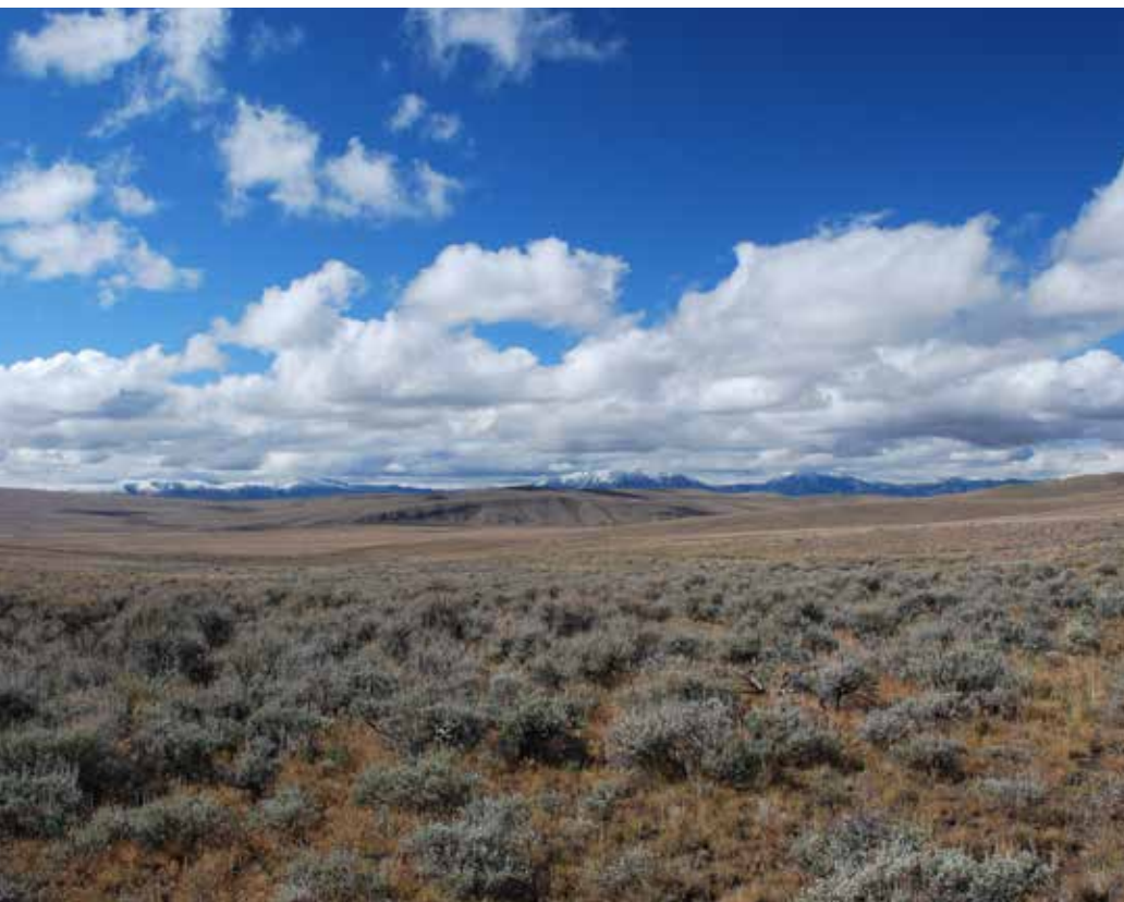
Rangelands support a wide range of multiple uses, from livestock production and recreation to wildlife habitat and water quality values, across federal, state and private ownerships.

A1J: Explore the expanded use of youth, veterans, inmate crews and conservation corps to provide cost-effective capacity to support forest and rangeland restoration work across various land ownerships.